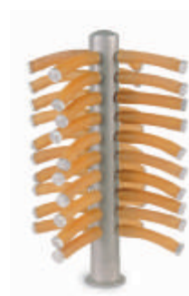
40 port manifold