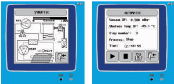
LyoAlfa 10/15 control panel screens

This model incorporates unique and high level control performances, as well as excellent technical features.