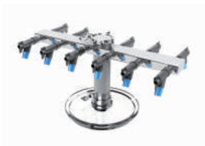
Stackable 12 port manifold with adaptor plate